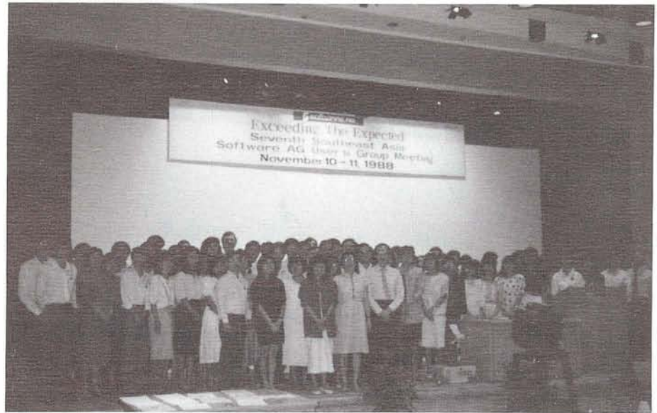
Over 75 people from Singapore, Malaysia and Hong Kong attended the 7th Annual Southeast Asia Users' Meeting.

The Conference was concluded with an excellent Chinese Banquet dinner which was noticeably appreciated by the representative from SAGNA.